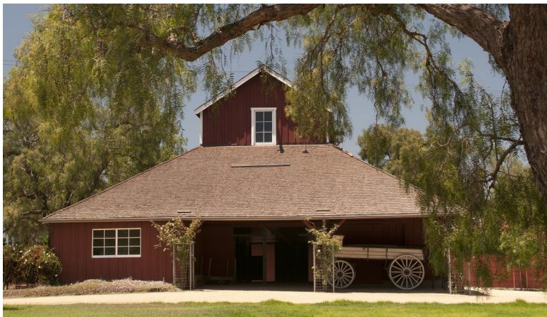
This is the Stallion Barn at Rancho Los Alamitos today